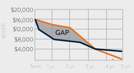
The above graph is for illustration purposes only.